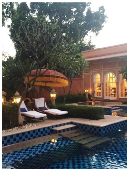
Room at the Oberoi Rajvilas