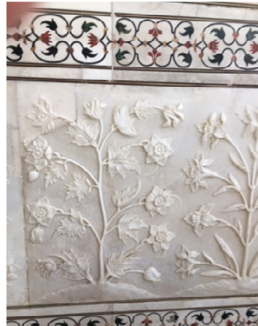
Carved Marble & Precious Stones

The white marble and hand hewn motifs made up of many tiny inlaid semi-precious stones are dazzling. The descendants of those original craftsmen continue in this specialized field to this day. We were fortunate enough to visit them as they carved and inlaid gem stones into beautiful tables, vases, boxes and everything in between. A craft that is so painstakingly detailed it is hard to imagine in this day and age. We could not even make a dent in the marble when we were given the tools to try!