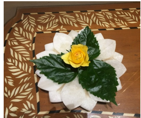
India - A Land of Beauty and Colour – Flower Petal Arrangements