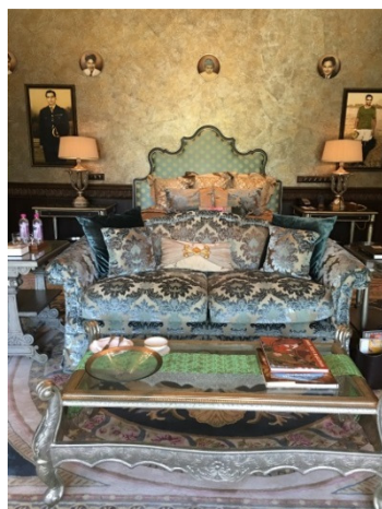
Rooms at the Rambagh Palace Hotel