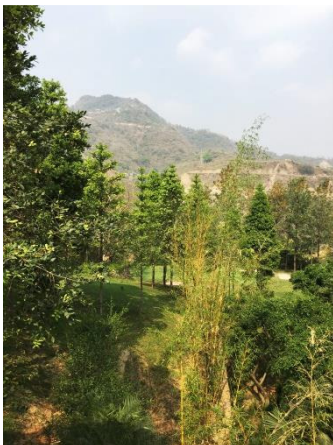
Ananda in the Himalayas