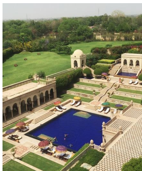
The Grounds of Oberoi Amarvilas, Agra

We returned from India excited to share our fantastic travel experience with everyone. This is a country that must not to be missed! Sometimes the images of India can be negative but in reality it is an incredible destination with lovely, warm people, clean streets (I mention this as it is something one does not often hear!), exotic aromas, wildlife reserves (tigers, rhinos and elephants come to mind!), vibrant colours, many religions, rich history and incomparable hospitality. Whether or not you have been before for business or pleasure, it always has something new and exciting to offer! It had been many years since my previous visit and I was completely “blown away” by how much it had changed.