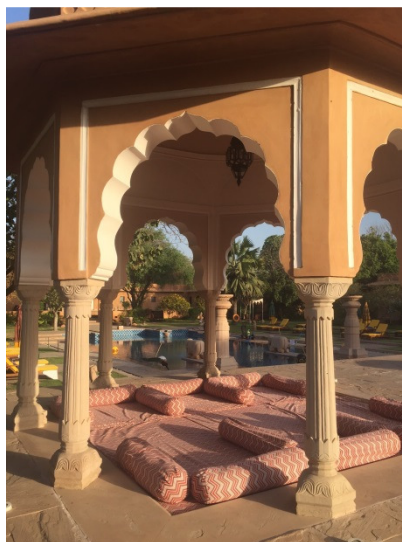
Pavilion at Oberoi Rajvilas

Just outside Jaipur, we stayed at the gorgeous Oberoi Rajvilas and I could have spent a week there in the gardens, spa and pool. In town we had lunch at the beautiful and historic Rambagh Palace Hotel. It was particularly fun to visit the famous Polo Bar from times past...which my brother remembers well from his polo playing days! The rooms retained their palatial feel with spectacular decoration and historic photos throughout.