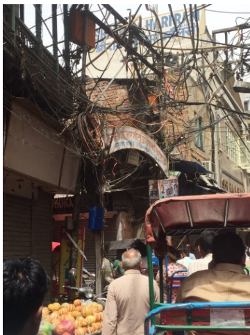
"High Tech" Overhead Wiring!!

We were kept busy as we visited our first stop, Delhi, where we were kindly hosted by Vikram and his team. Beyond the must-see sights, of which there are many, a heart-in-mouth rickshaw visit to Old Delhi's narrow, colourful, bustling streets and "interesting" overhead wiring which has to be seen to be believed!; delicious lunches, dinners in five star restaurants with a standout being at the Varq restaurant at the Taj Hotel, where we were their guests; historic forts, ancient mosques and beautiful fragrant gardens. Without exception our hosts were warm and welcoming and did everything in their power to give us the traditional warm Indian welcome - and we felt it!