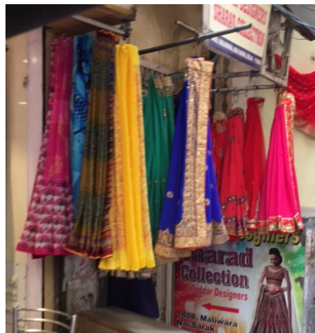
Shopfronts in Old Delhi