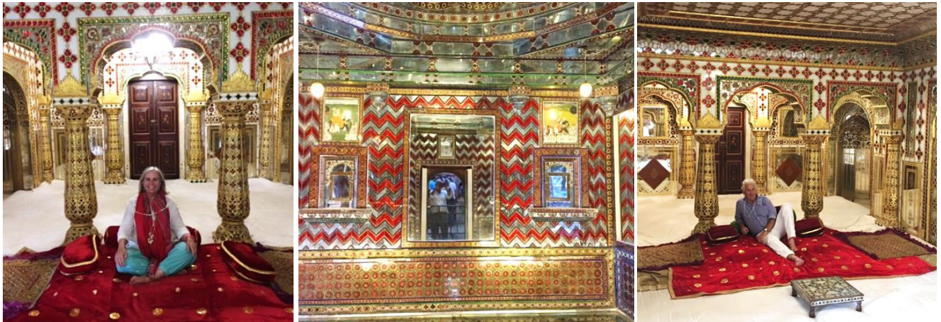
Private Rooms in the City Palace, Jaipur

After lunch, a highlight was a visit to the City Palace where the Maharajah of Jaipur lives. Most of this opulent palace is open to the public but we were privileged to have been allowed behind the scenes into private areas which the family still use. If I have ever felt like a princess this was the time – lounging on red velvet cushions in a room entirely encrusted with semi-precious stones and mirrors. Words cannot really describe this experience... India's history comes alive when one "walks the corridors" of these palaces and the memories will always be with me.