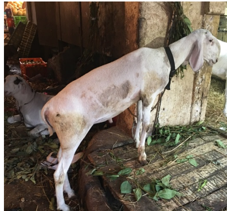
Roman Nosed Goat