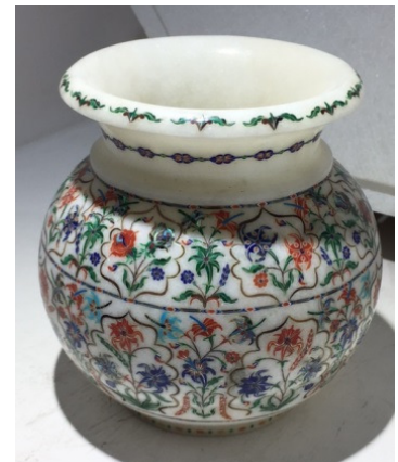
The Process of the Hand Hewn Designs and Inlaid Marble Vase with Semi-precious Stones

This entire trip combined ancient history with the modern bustling world...Mughal Forts, extravagant palaces, where we had private viewings of the mirrored and bejeweled interiors. Each day we returned very fulfilled (and tired!) to our Oberoi Suites with private pool and gardens! How spoilt we were but it did remind me why I always recommend more leisure time for our guests – I treasured every moment we had in our beautiful accommodation but would have loved to have had more than two nights in each place!