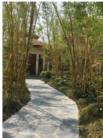
Ayurvedic Wellness Spa