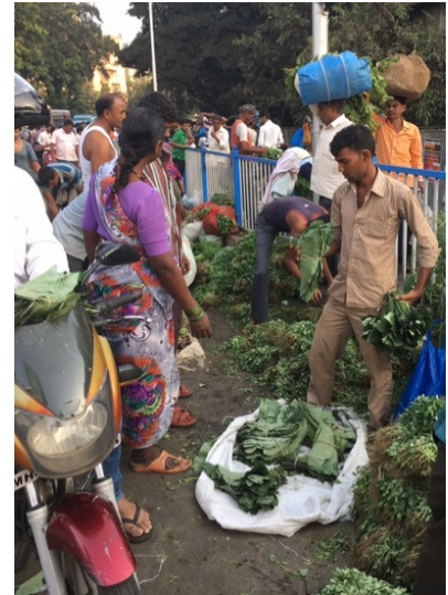
Vegetable Market on the Street

Farley had to return to her family and Jim and I continued to Ananda in the Himalayas, an Ayurvedic Wellness Spa. This was the perfect place to end our “exotic safari” in India and one I would highly recommend to anyone who may be seeking peace and tranquility. Set in the foothills of the Himalayas, Ananda brought me peace and joy. Without exception the staff were a total delight...the wellness spa offered traditional Ayurvedic treatments as well as some more modern offerings, inspiring yoga lessons and meditation, excellent locally grown food, the menu was planned according to one’s dosha (body type) - and no Coca Cola which was a challenge for me!! There were daily lectures on many different subjects which were inspiring and thought provoking. At the end of five days I felt peaceful (not too common for me!), energized and ready to take on the world again! I wish I could have stayed for weeks! Maybe for my next birthday!